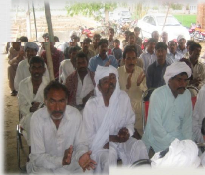
Assets Transfer Seminar